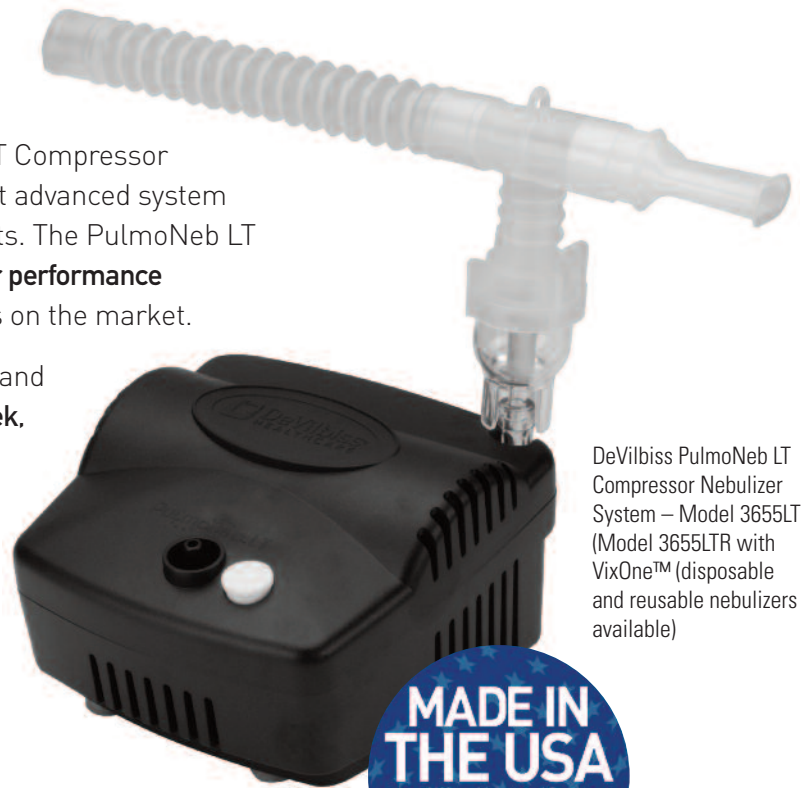
DeVilbiss PulmoNeb LT Compressor Nebulizer System – Model 3655LT (Model 3655LTR with VixOne™ (disposable and reusable nebulizers available))

Intuitively designed, this system is easy for new and young patients alike to operate. Its profile is sleek, compact, and lightweight . In addition, integrated wire guides eliminate contact with moving parts and ball bearing connecting rod design further enhances the system's reliability.