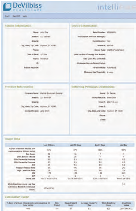
IntelliPAP AutoAdjust Summary Report Using SmartCode System