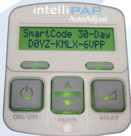
DeVilbiss SmartCode as displayed on IntelliPAP

The DeVilbiss SmartCode is an effective and efficient way to remotely track adherence data. With a simple phone call to the patient, providers or clinicians can obtain key adherence monitoring data. Best of all, the data is objective as required by the new Medicare CPAP Local Coverage Determination (LCD).