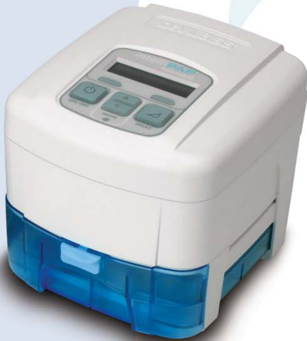
DeVilbiss IntelliPAP AutoAdjust System (Model DV54D-HH)

From its reliable electronics and water resistant housing to its durable Lexan® humidifier chamber and stainless steel heat transfer plate, IntelliPAP is built for years of dependable performance and patient satisfaction . It's just what you would expect from DeVilbiss – the widely recognized leader in respiratory technology.