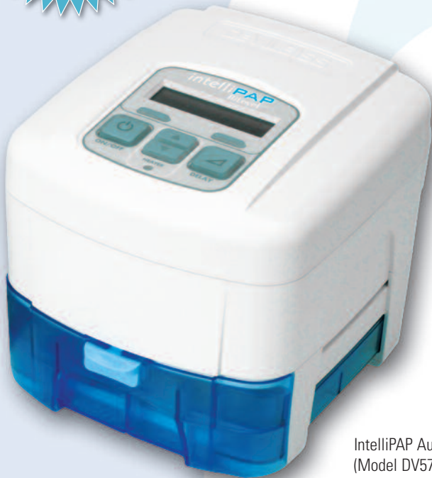
IntelliPAP AutoBilevel System (Model DV57D-HH)